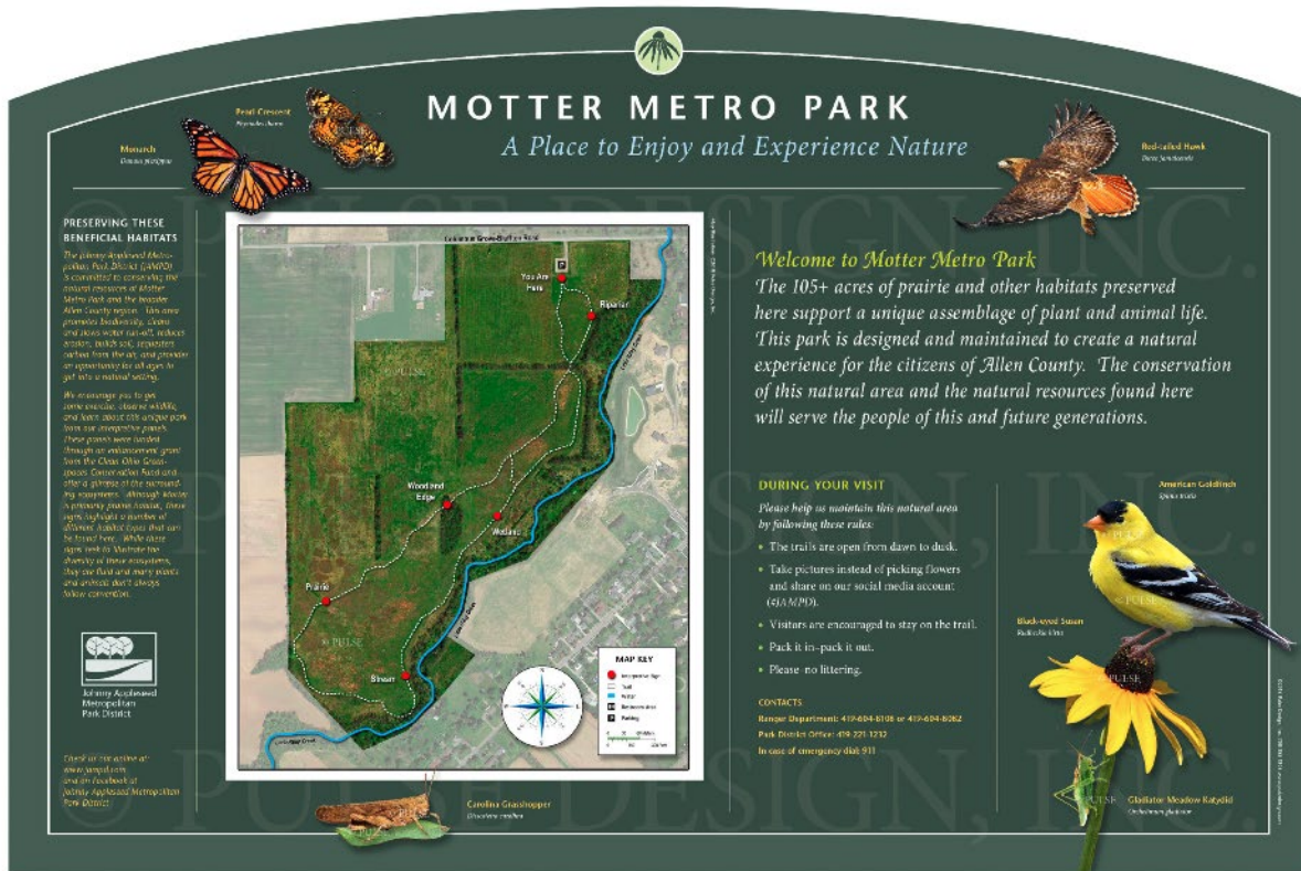
"PULSE DESIGN NATURE SERIES" Interpretive Trail Sign #010-3654-11A-15918, Size 36"x54", ©2018 Pulse Design, Inc. To Order: Call 708-385-1308 or Visit: www.pulsedesign.com